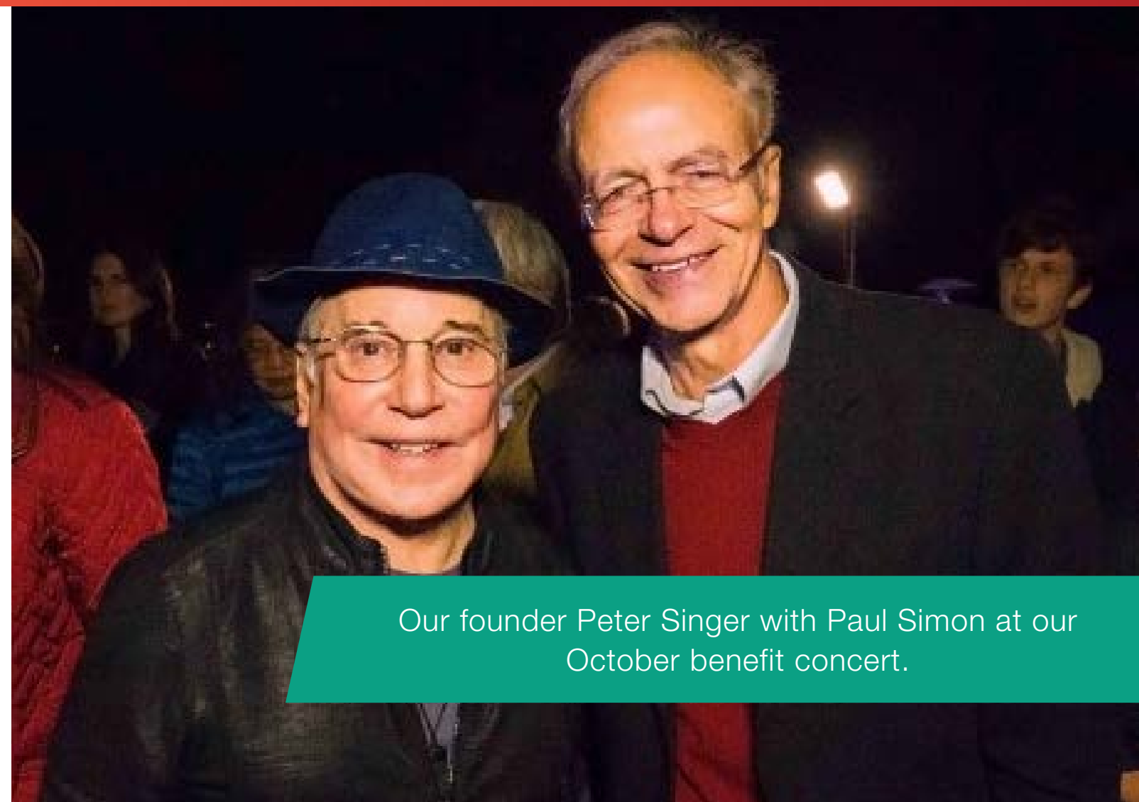
Our founder Peter Singer with Paul Simon at our October benefit concert.

We've partnered with One for the World , a like-minded organization founded at the University of Pennsylvania's Wharton Business School, to become their fiscal sponsor. This means that officially, One for the World is now part of The Life