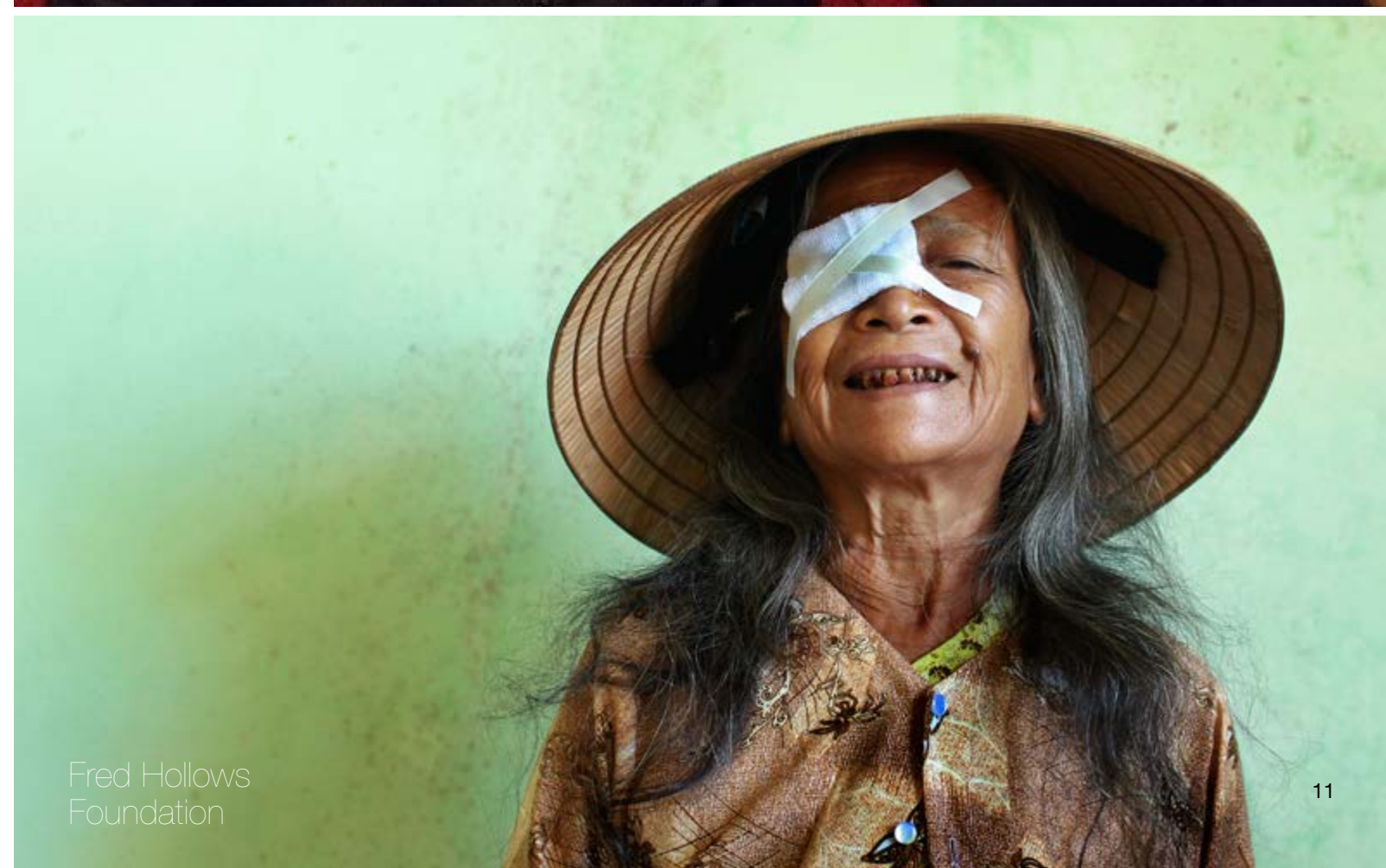
Fred Hollows Foundation

One for the World's goal is to expand globally, influencing thousands of students to practice conscious and thoughtful giving.