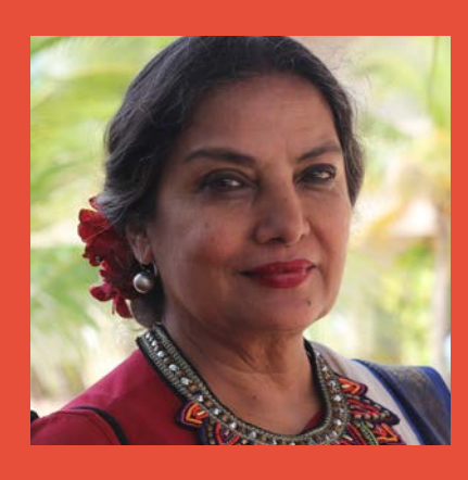
Shabana Azmi Indian actress & activist